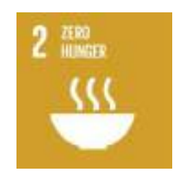
SDG 2 End hunger, achieve food security and improved nutrition and promote sustainable agriculture.