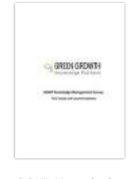
GGKP Knowledge Management Survey: Final Results and Recommendations (August 2015)