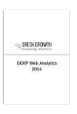
GGKP Web Analytics and Social Media Annual Report (2014, 2015, 2016)