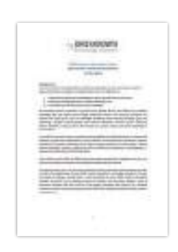
GKKP Research Committee Review: Observations and Recommendations (May 2015)