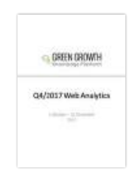
GGKP Web Analytics and Social Media Quarterly Report (Q1-Q4 2014, Q1-Q4 2015, Q1-Q4 2016, Q1-Q2 2017)