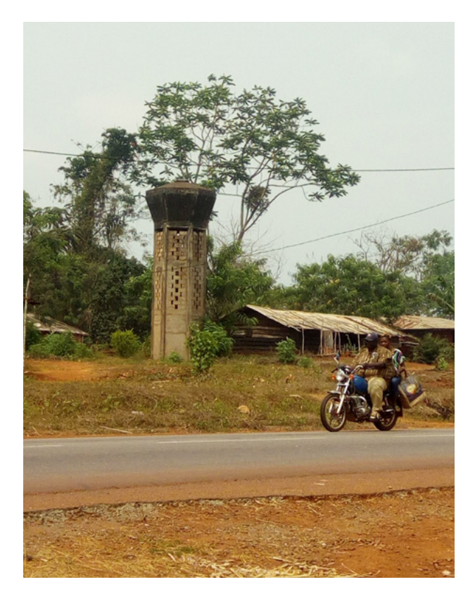
Figure 2 – The city of Doumé