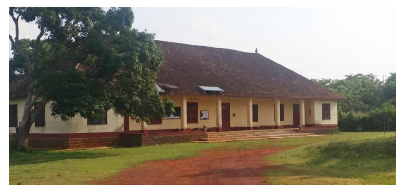
Figure 4 – Hospital building in Doumé

"After the elaboration of the Doumé's 2019 Action Plan to Access Renewable Energy and Climate (APAREC) and the identification of priority projects, the financial resources mobilization for implementation became an important issue. Thanks to TAP platform's support, we were oriented towards project preparation, which significantly enhanced our skills in the area. As a result, Doumé obtained technical assistance in project maturation in 2020. TAP is an amazing tool to follow local and regional governments in preparing their projects, guaranteeing their bankability."