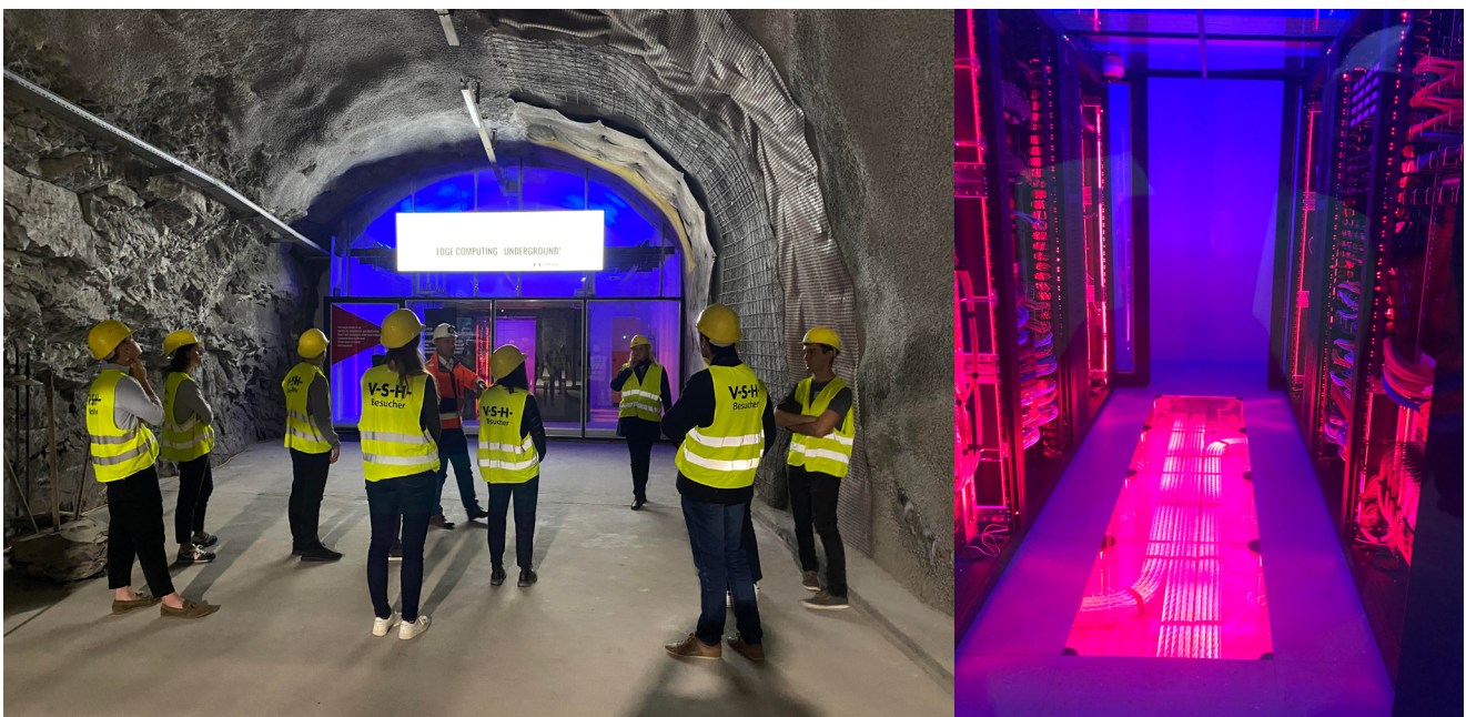
EDGE COMPUTING UNDERGROUND AT HAGERBACH TEST GALLERY

Despite the limitations of using underground spaces, Helsinki's underground data centre sets a precedent for using underground spaces for multiple purposes in a very safe space, while delivering social and economic benefits to nearby communities and adapting to the severe winter climate. It helps reduce demand, costs and thus carbon emissions from fuel and energy – both of which are expensive in Finland and in many other countries worldwide.