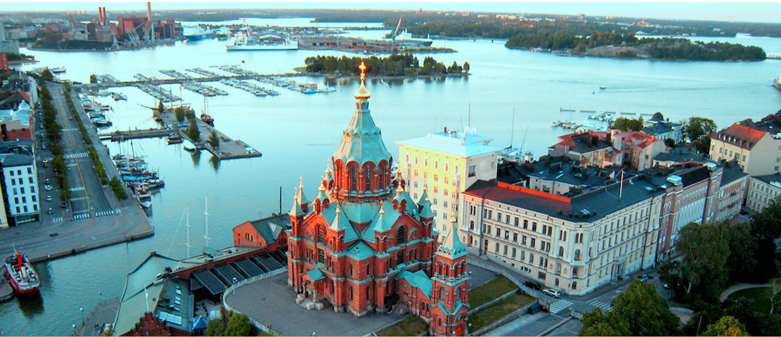
THE USPENSKI CATHEDRAL IN HELSINKI, FINLAND