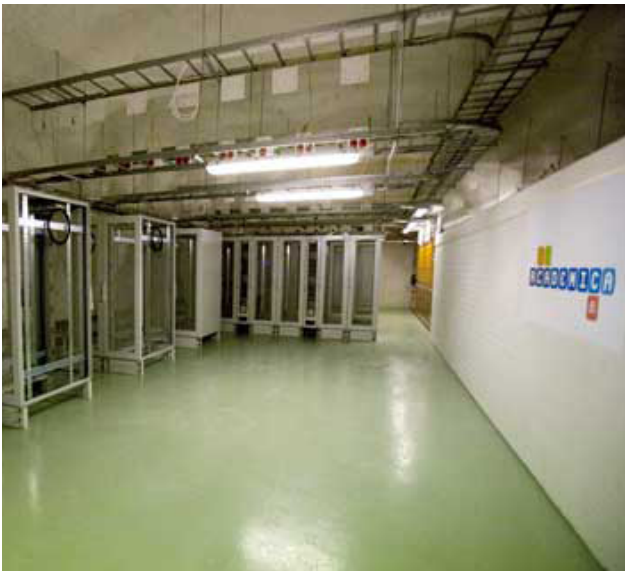
A SECTION OF THE DATA CENTRES BENEATH THE USPENSKI CATHEDRAL

Developing new underground spaces need to be done in a sustainable manner if the overall solution is to benefit the environment. This holds true for any urban development, whether constructing data centres at or below the surface. Urban policy and planning could help here in defining areas where underground space development would be allowed. The creation of any underground space needs to be flexible and promote multiple uses over time. In essence, the development and use of underground spaces should not be limited to single purposes.