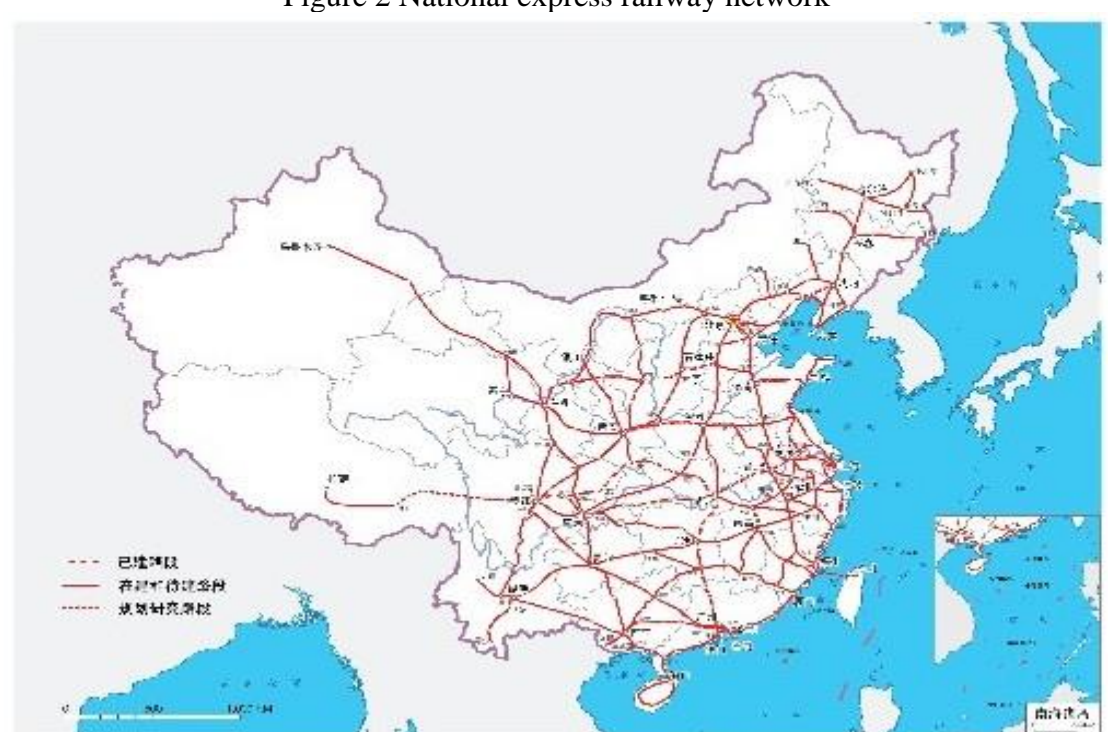
Figure 2 National express railway network

Column 7 Priorities of traffic construction, Xinhua News Agency