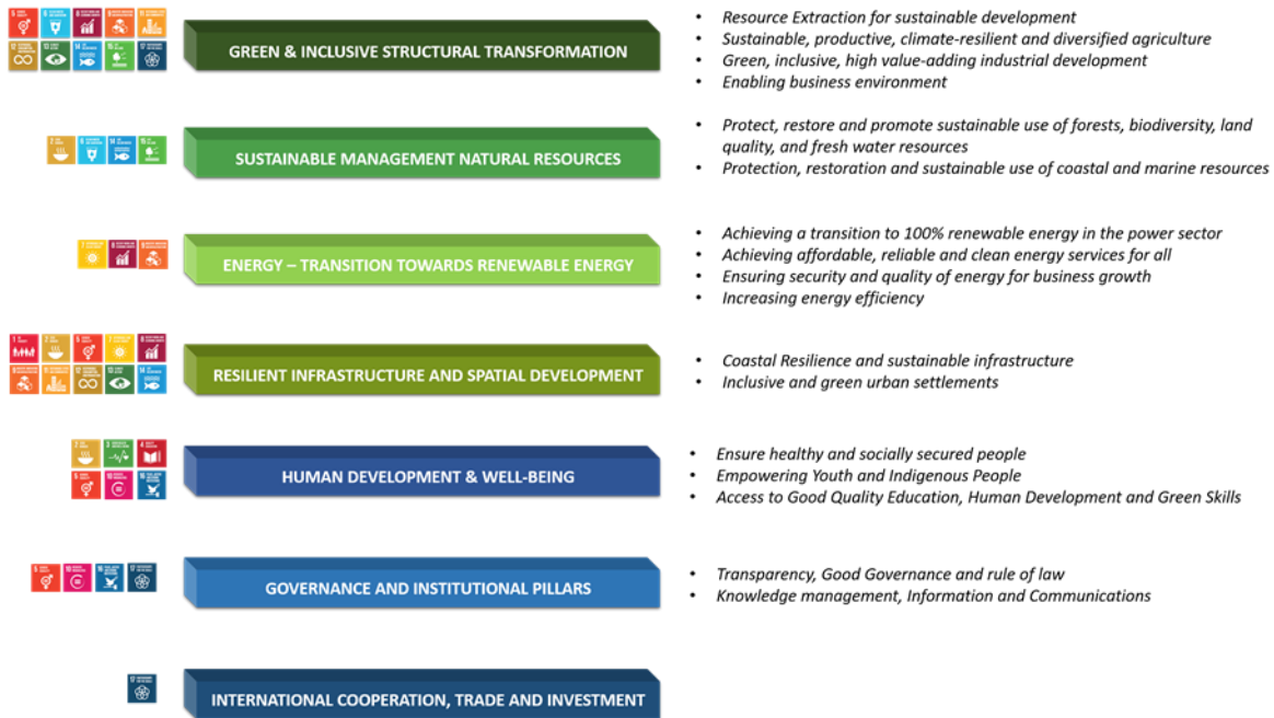
Figure 3. Central themes of the GSDS and its relation with the SDGs

Seven central themes will be comprehensively developed and implemented, responding to the country’s human and economic development, and addressing both the “Energy Transition Plan” and the implementation of the Sustainable Development Goals at the national level. See Figure 3.