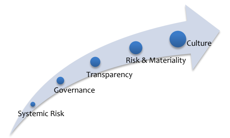
Figure 3: Evolving Financial Standards to Embed Sustainable Development

There is an opportunity to build on the synergies and extend the notion of sustainable development as international financial standards continue to evolve. This is not a straightforward task and the paper provides a number of suggestions as to how this might unfold, including the possible introduction of an overarching principle of "Maximum Social Benefit" that encapsulates the goals of sustainable development as they relate to financial standards in a coherent and consistent way.