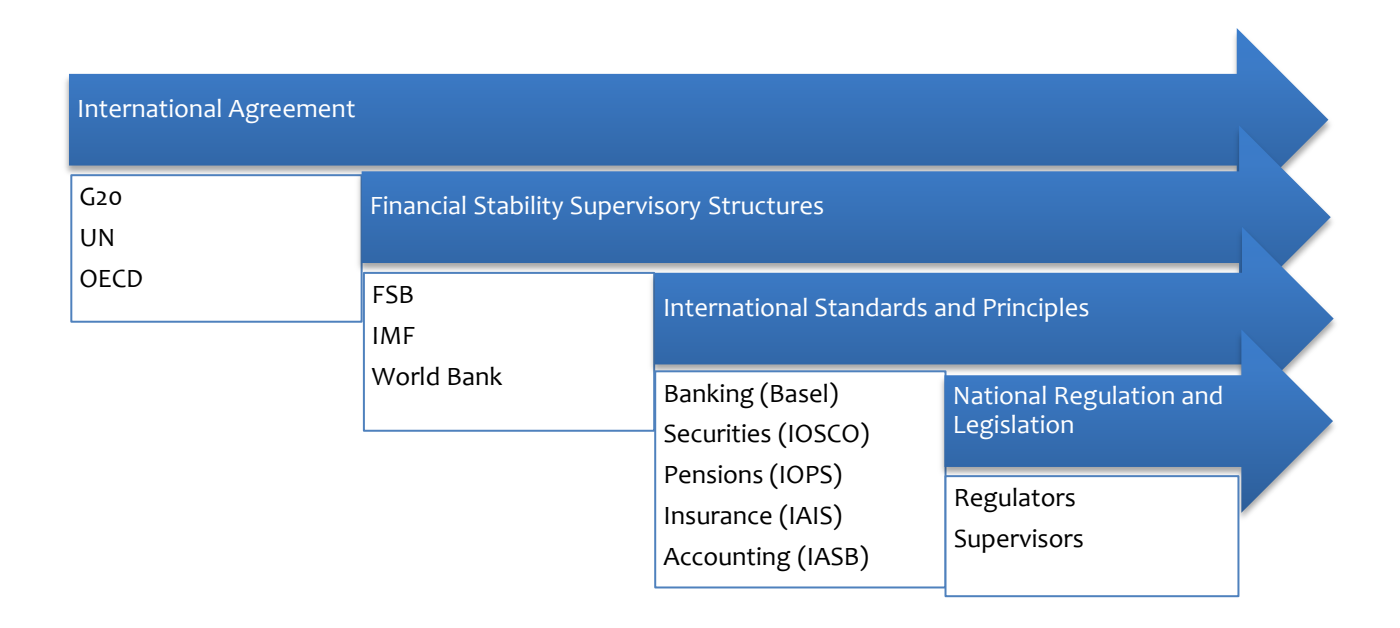
Figure 2: The Global Regulation Process