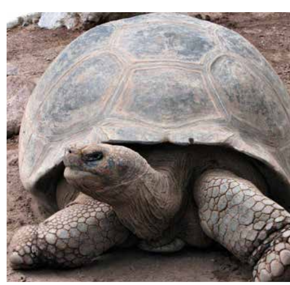
"CHELI" TORTUGA GALÁPAGO.