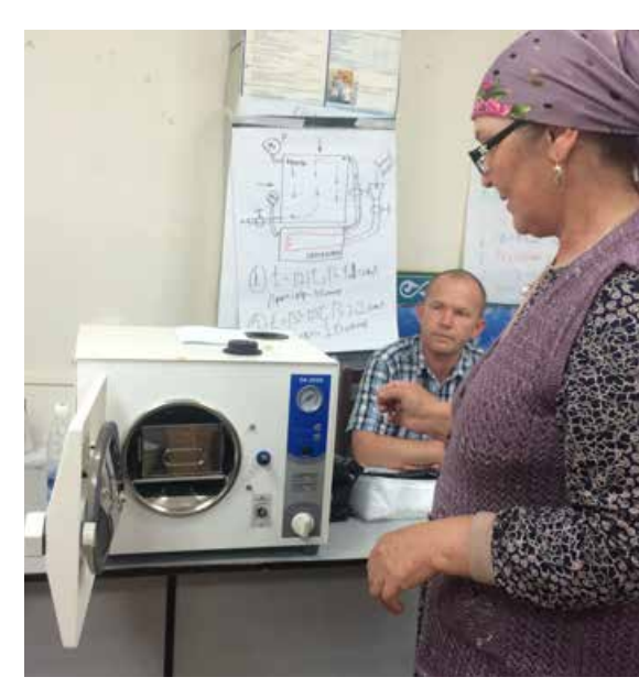
TRAINING ON USING THE PORTABLE TABLE AUTOCLAVE.