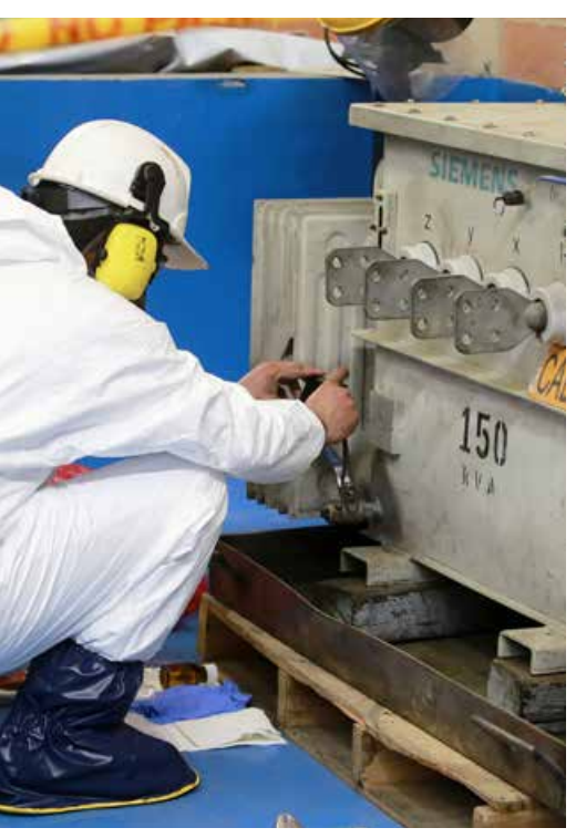
PCB PROJECT IMPLEMENTATION.