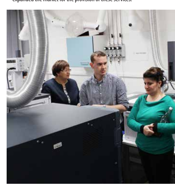
TRAINING ON POPS MONITORING. RECETOX CENTRE, MASARYK UNIVERSITY.