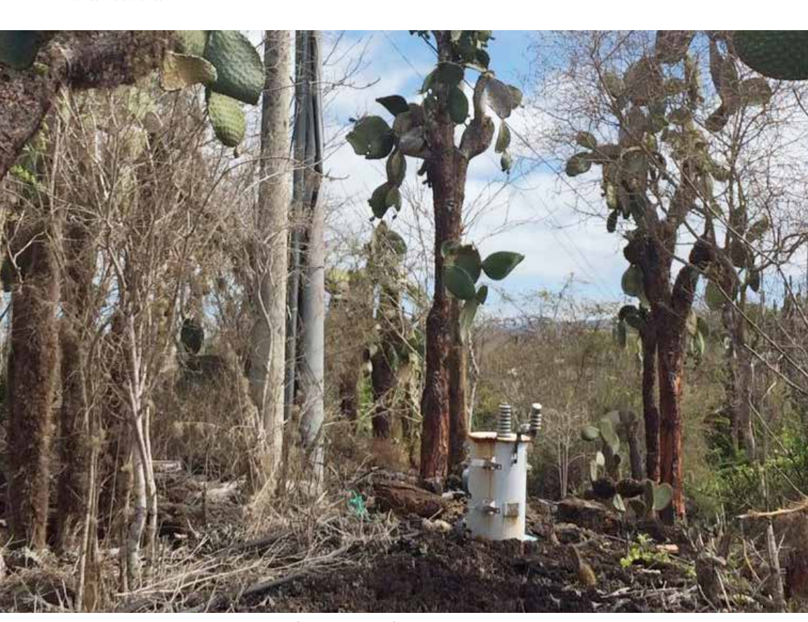
REPLACEMENT OF PCB CONTAMINATED TRANSFORMER (ISABELA, GALAPAGOS).