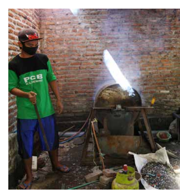
A MALE WORKER DISMANTLING E-WASTE IN MOJOKERTO AREA.