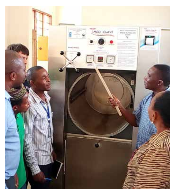
AUTOCLAVE OPERATION TRAINING. PHOTO BY UNDP TANZANIA