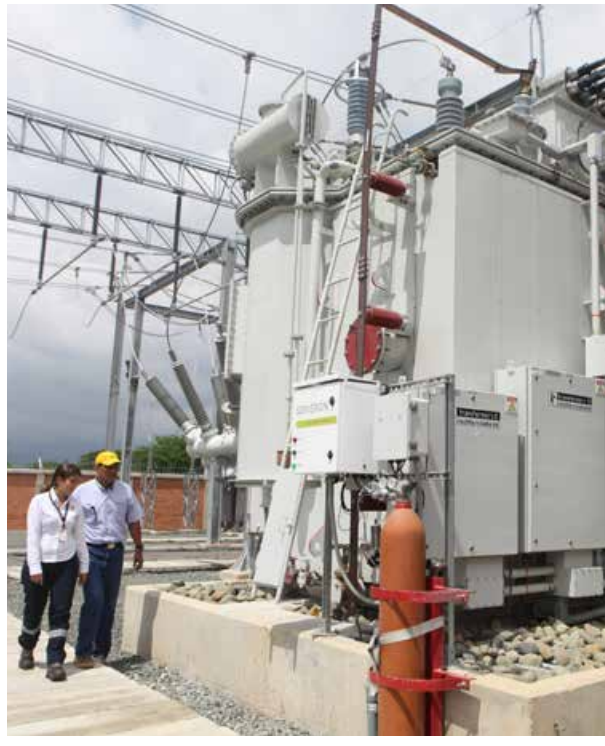
PCB PROJECT IMPLEMENTATION.