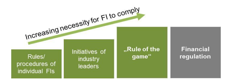
Chart 5: Leadership creates peer pressure

Rules and procedures of individual FIs primarily target risk management, and, in particular, reputational risk (e.g. cluster ammunition policies). Initiatives of industry leaders as a group can primarily be observed in cases where substantial competitive disadvantages would arise, i.e. business would be lost, if certain ESG criteria were established (e.g. Equator Principles). These might finally develop into rules of the game, if there is sufficient uptake from others such that a non-adhering institution would risk being isolated and need to explain its position.