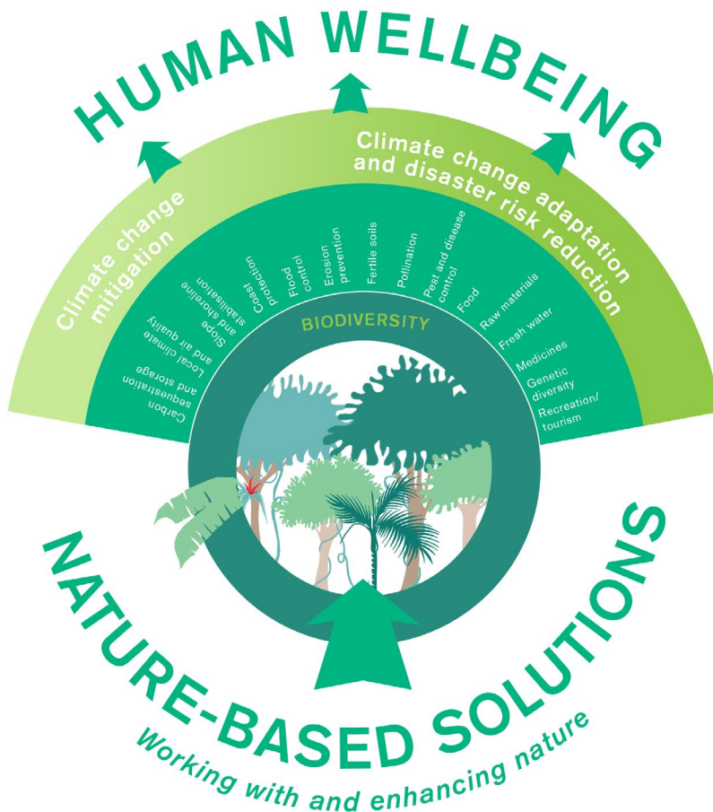
Figure 1. What are nature-based solutions?

Many nations articulate a broadly 'nature-based' vision for adaptation in their NDCs and propose a range of 'green' actions to achieve these visions, involving the restoration and/or protection of natural ecosystems or agroforestry. 10,12 For example, Ethiopia aims to 'enhance the adaptive capacity of ecosystems, communities and infrastructure through an ecosystem rehabilitation approach'. In total, 103 nations highlight one or more NbS actions in the