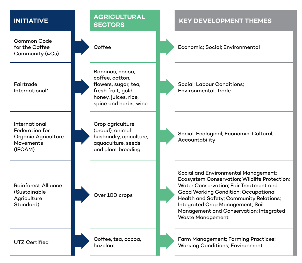
Figure 2. Overview of five voluntary standards

The five standards were chosen for several reasons, including their significant market coverage, more significant efforts than other standards to integrate gender in their certification criteria and their longer history (which has afforded time for researchers to document evidence of the ways they promote gender equality). These same five standards were analyzed in the IISD companion report to this guidebook (Sexsmith, 2017). Since the time of that publication, two of the standards have released new versions: Fairtrade International's Fairtrade Standard for Hired Labour (201) and the Rainforest Alliance Sustainable Agriculture Standard (2017). Figure 2 summarizes the agricultural sectors and the key development themes addressed by each of these five standards.