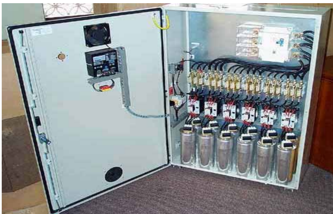
Figure 4 An automatic capacitor bank in a metal case