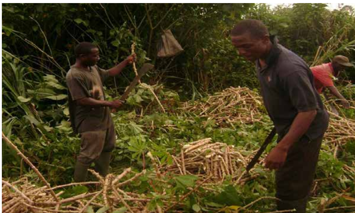
Figure 3 Coppicing of improved cassava planting materials