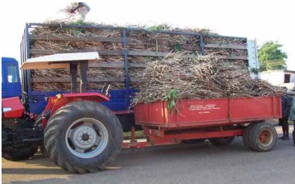
Figure 1 Bundles of improved cassava planting material ready for distribution