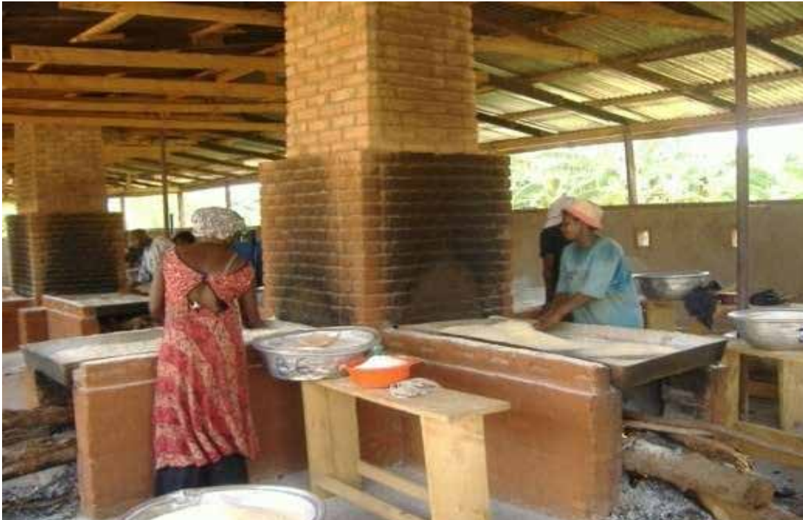
Figure 2 Gari processing at Good Practice Centre at JOSMA, near Mampong-Ashanti