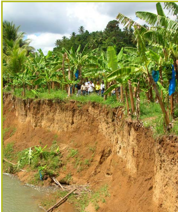
Farms in Saint Lucia are vulnerable to heavy rainfall that washes away riverbanks.

Development within the Caribbean region, particularly among the smaller, resource-poor member states and territories of the Eastern Caribbean is at the crossroads. Economic performance since 2010 has been characterised by low and inconsistent growth, precarious national debt profiles, unsustainable fiscal positions, high unemployment, eroding economic competitiveness, declining national savings, falling inward investments, a widening poverty gap, disturbing levels of violent crime, and unpredictable weather patterns disrupting economic activities. Additionally, the islands in the sub-region share many challenges, including constricted sizes and population, narrow production possibilities, lack of economies of scale, acute vulnerability to external shocks including climate change, and underperforming economic and political governance structures. The resultant economic uncertainty has led to increasing social upheaval, marked environmental degradation and greater marginalisation of the more vulnerable populace.