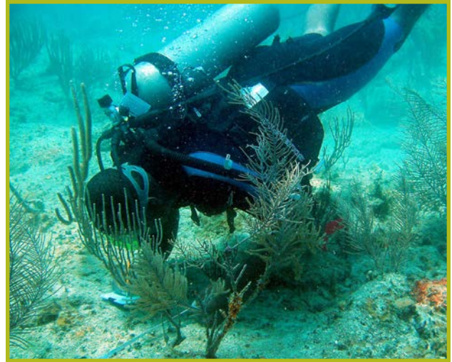
Economic development in the small islands of the OECS is reliant on healthy natural ecosystems like the forests of St. Vincent and the coral reefs of the BVI.

Indeed, a GE is simply a novel, enlightened economic and social development pathway that is based on environmentally friendly values and strategies that support sustainable livelihood activities and socio-economic development at community, countrywide and regional levels.