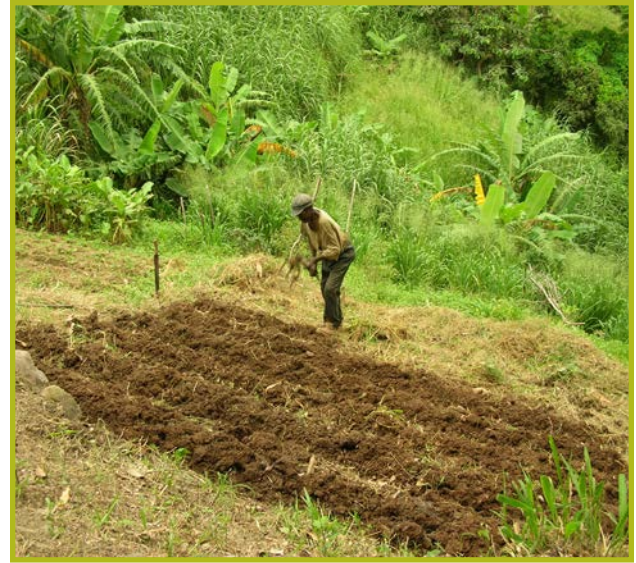
Small scale farming contributes to food security in Montserrat.