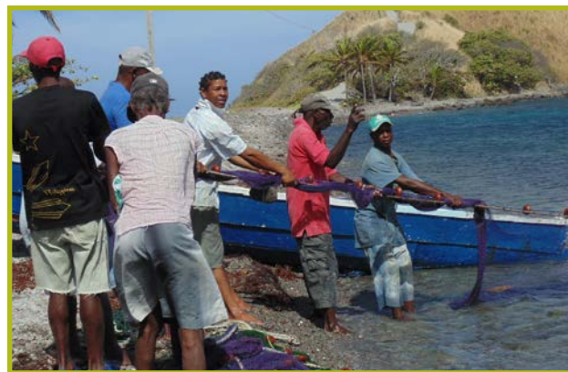
Valuing natural ecosystems, like those found along the coast of the OECS, like these fishers in Dominica, must be at the centre of economic transformation.

governed, competitive, socially inclusive economy is to take shape.