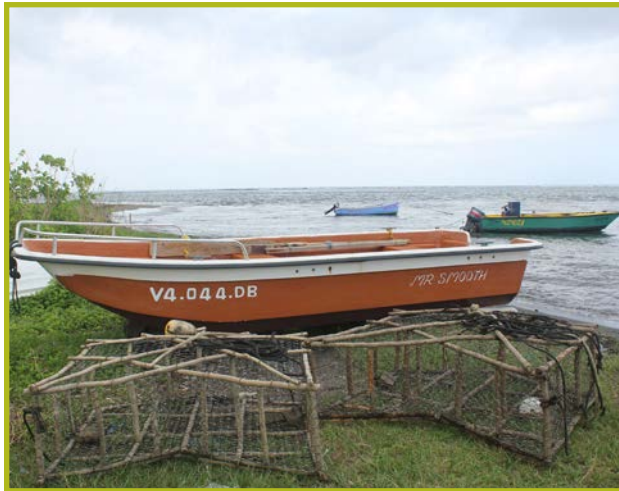
Small scale fisheries in St. Kitts and Nevis are important for food security and livelihoods.