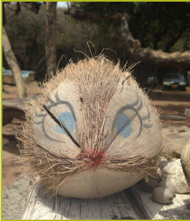
Caribbean culture is intimately tied to the natural environment.