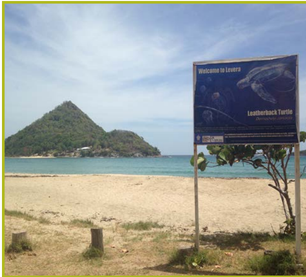
Protected areas in Grenada protect the rich natural heritage.