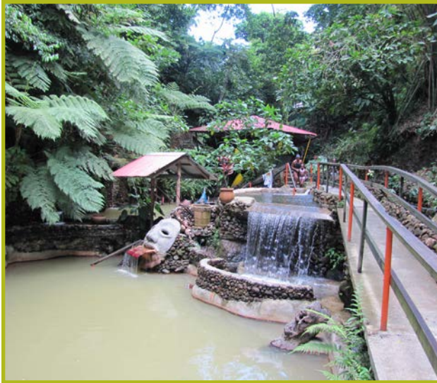
Dominica's natural hot springs are an attraction for locals and visitors alike and support local green enterprises.

marine spatial plans and national ocean policies and strategies through active citizen engagement; ocean education in conjunction with the private sector; mapping ocean assets and enhancing OECS ocean data coverage and access through collaborative public-private platforms.