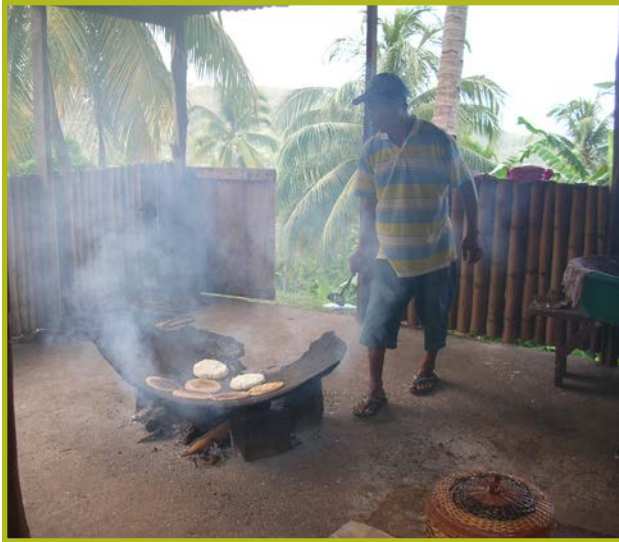
Traditional cassava bread is still made by the Kalinago people of Dominica.

economy idea is mainstreamed and receives the highest consideration by the most important policy advisers, formulators and decision-makers. It is essential to state that it is ultimately the OECS countries themselves who would have to lead and champion the GE transition process if it is to succeed.