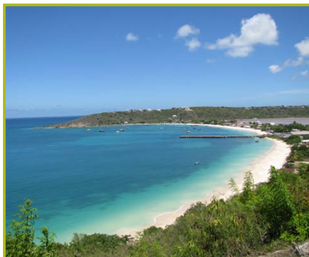
Anguilla's protected harbours are key to its economic development.

Anguilla: CANARI conducted a GE scoping study in Anguilla (CANARI 2013), which concluded that: "(a) There is an extensive body of knowledge available on natural resource management in Anguilla. However, the data is strewn over multiple scientific studies, consultant reports, regional reports and approved and draft legislation, policies and plans. This makes it extremely difficult to use this information effectively for decision-making. (b) The framework for natural resource management is made up of a range of policy documents and laws and regulations that have been developed in the absence of an approved integrated approach to environmental management. "