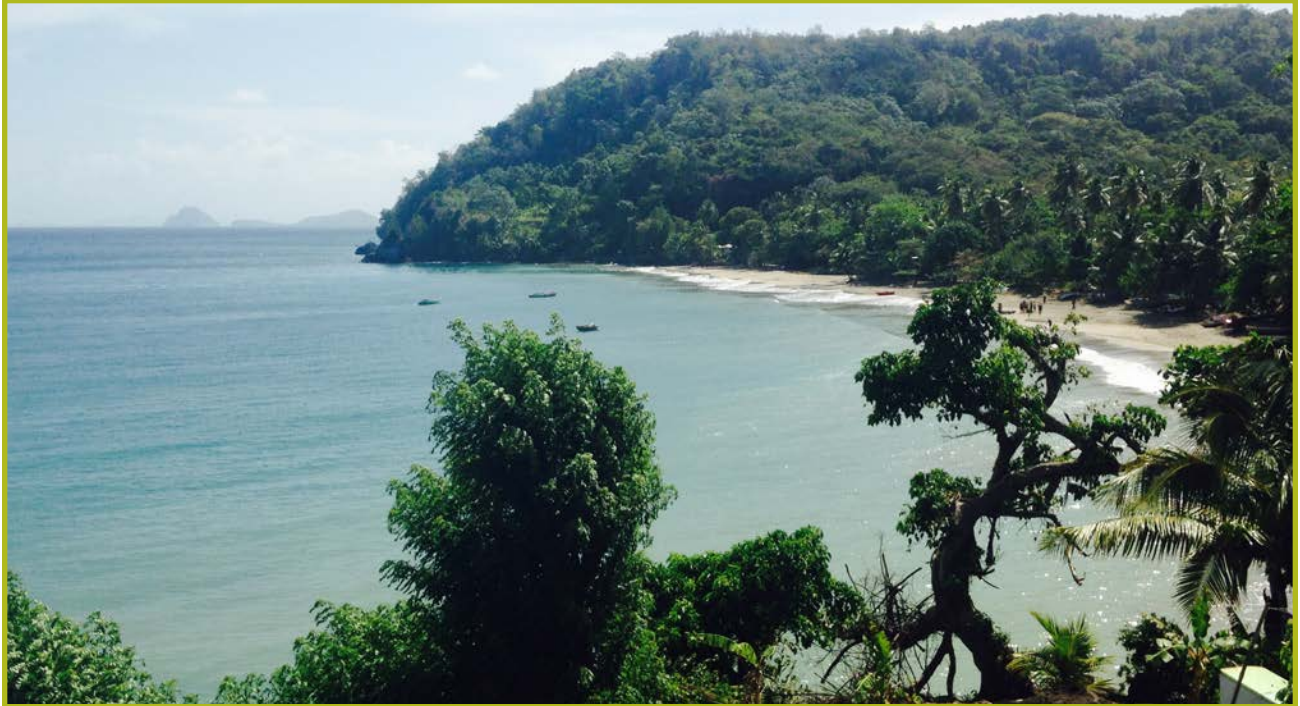
Valuing natural ecosystems, like those found along Grenada's coasts, is central to economic transformation in the OECS.