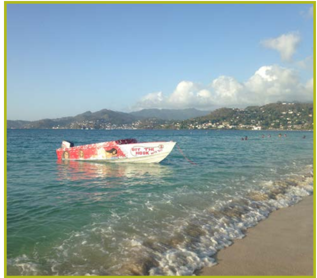
Development of Grande Anse beach is one element of Grenada’s Blue Growth Coastal Master Plan.

Martinique: Initiatives in waste management/ recycling, energy, biodiversity, and most critically vehicle emissions (based on EU standards) can provide models with