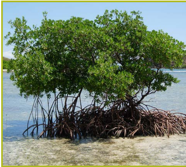
Most of the mangroves in the BVI were destroyed by 2017 hurricanes, leaving coastlines vulnerable.

recovery efforts post-Irma, the BVI is considering how it can rebuild greener overall and not “just back to the same old same.”