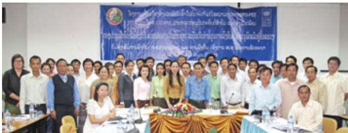
... as well as cross-cutting themes such as capacity-building on, for example, the monitoring of investments into natural resource management.