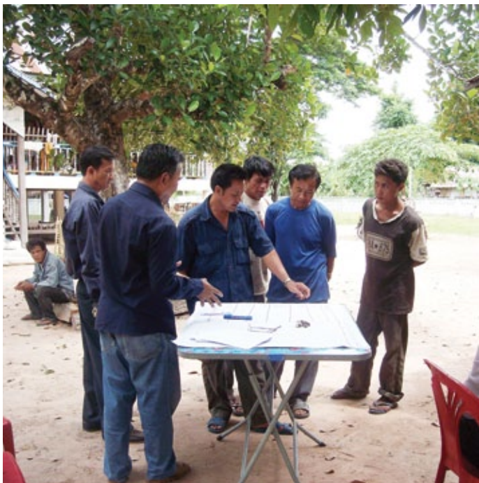
Mainstreaming in Lao PDR focusses on key revenue-earning sectors such as sugar cane production...