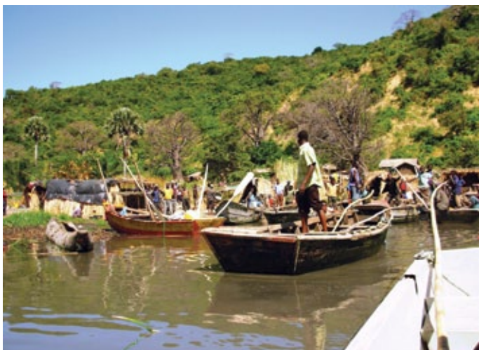
Fishing is a major occupation, source of income, and principal provider of dietary protein for the people of Malawi.