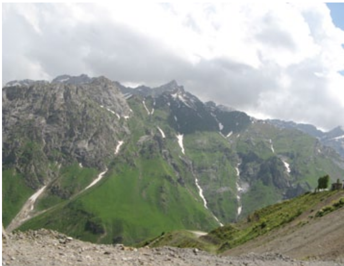
Mountainous and remote, Tajikistan has spectacular rural landscapes...