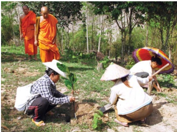
Natural resource management remains the mainstay of the Lao PDR economy...