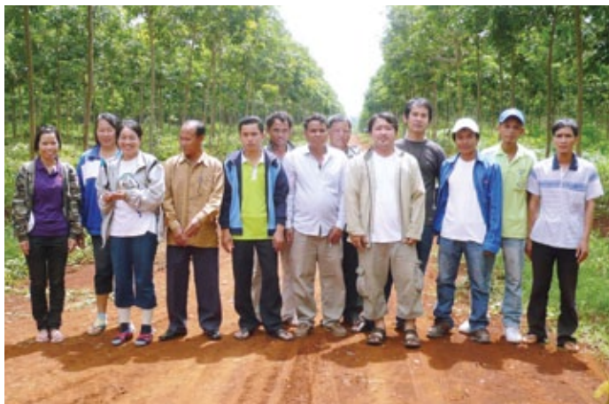
... and mainstreaming officials in the field at a rubber plantation in Lao PDR.