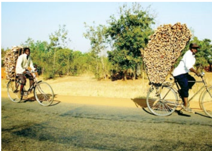
Forests in Malawi supply the majority of the population with fuel for cooking as well as building materials for industrial and domestic uses.