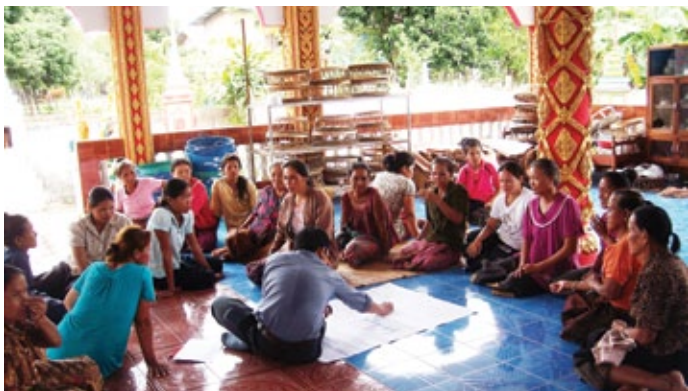
Participatory approaches are employed to ensure that women's voices are heard during the consideration of different investment options.