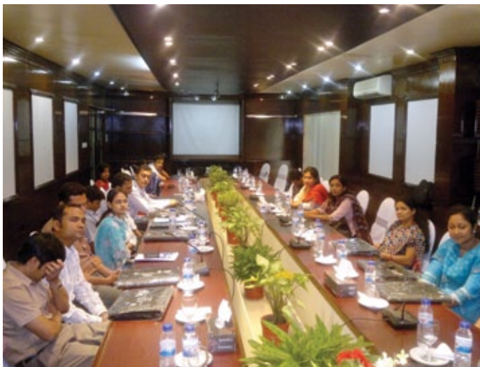
Discussions aimed at integrating poverty-environment issues into development planning and budgeting take place national level...