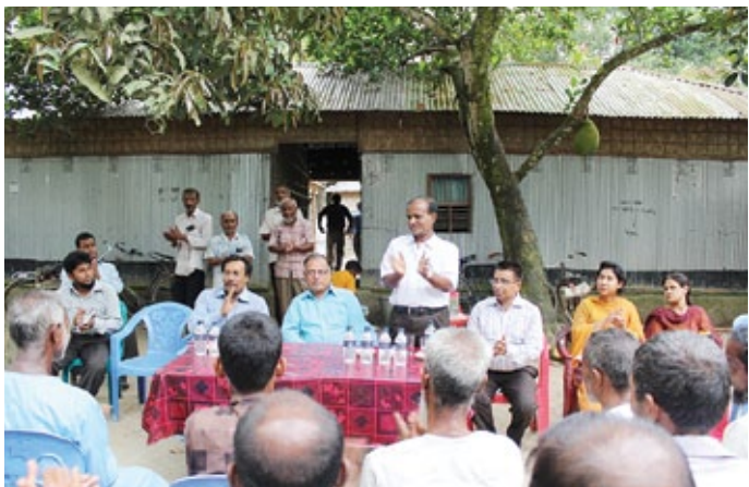
... and at sub-national and local levels, in order that on-the-ground realities are reflected in decision-making.