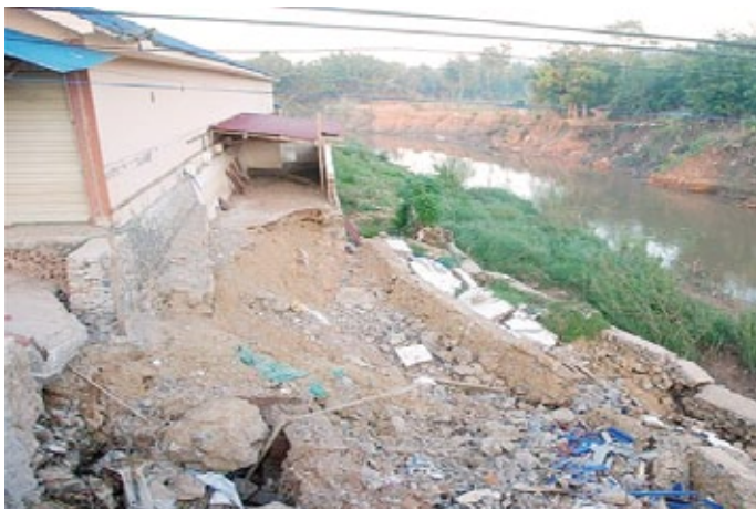
.... and livelihoods are threatened by natural disasters such as flood damage, seen here in Oudomxay Province.