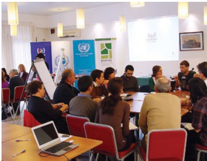
Architects of change - local government staff during training on poverty-environment issues in Uruguay...