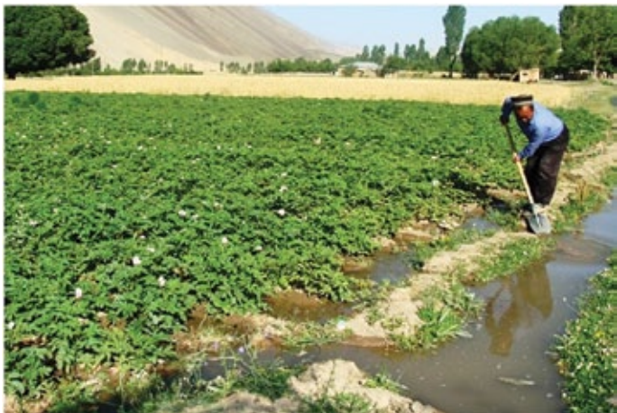
... but less than 10% of the land area is suitable for agriculture, in this case cotton, which is the country's leading agricultural commodity.