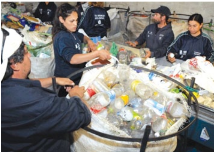
Ave Fenix cooperative workers separating and recycling domestic waste - an example of poverty-environment mainstreaming for an inclusive, greener, economy.