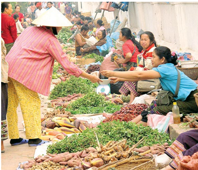
Local markets offer important income opportunities for farmers throughout the country.