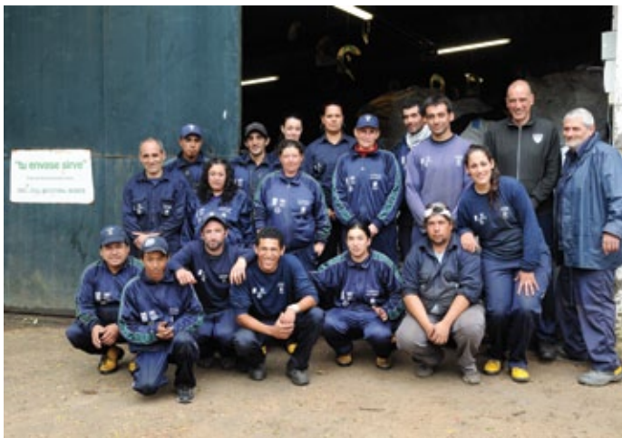
The formalisation of previously informal, unregulated, and unprotected workers has multiple social, economic, and environmental benefits.