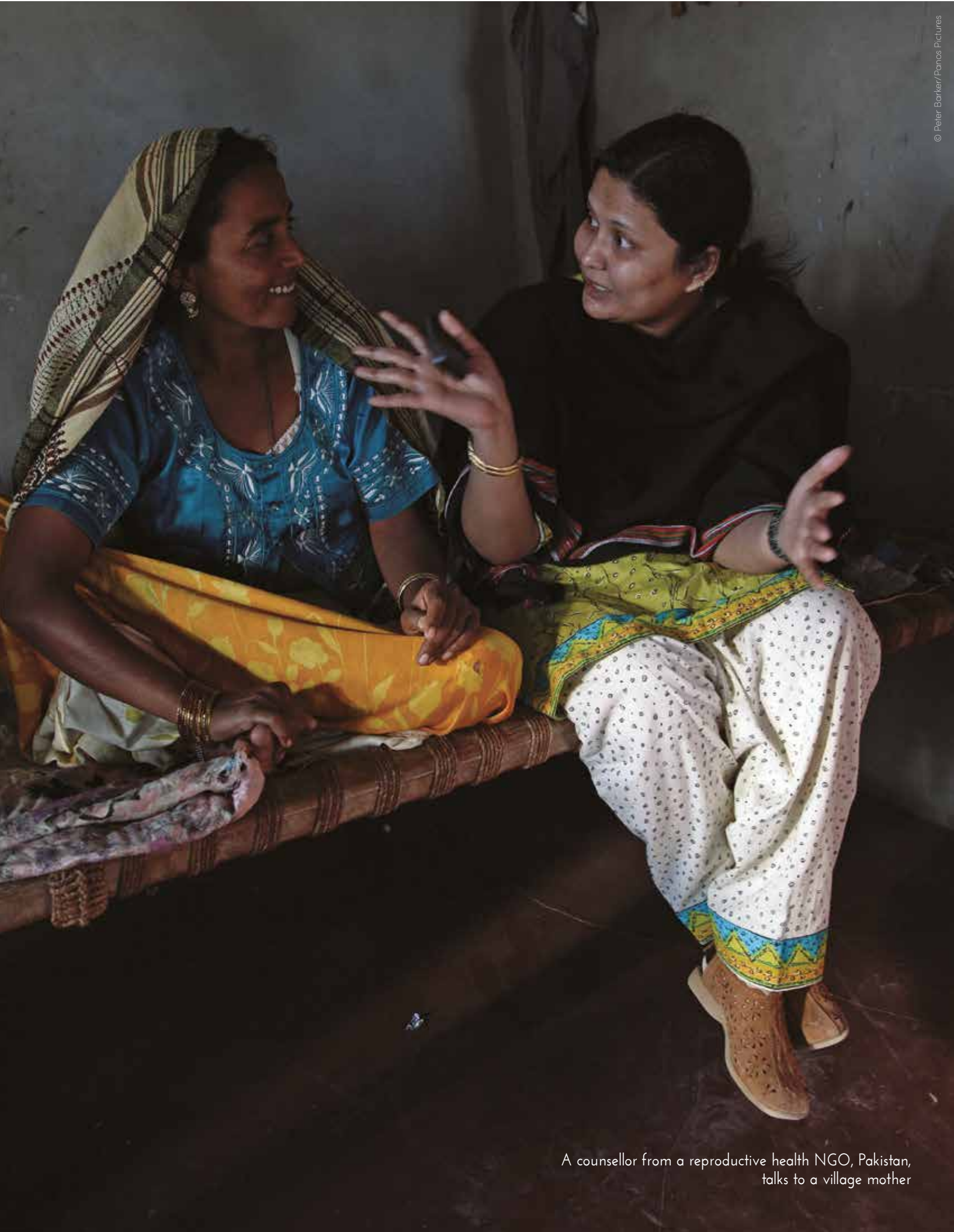
A counsellor from a reproductive health NGO, Pakistan, talks to a village mother