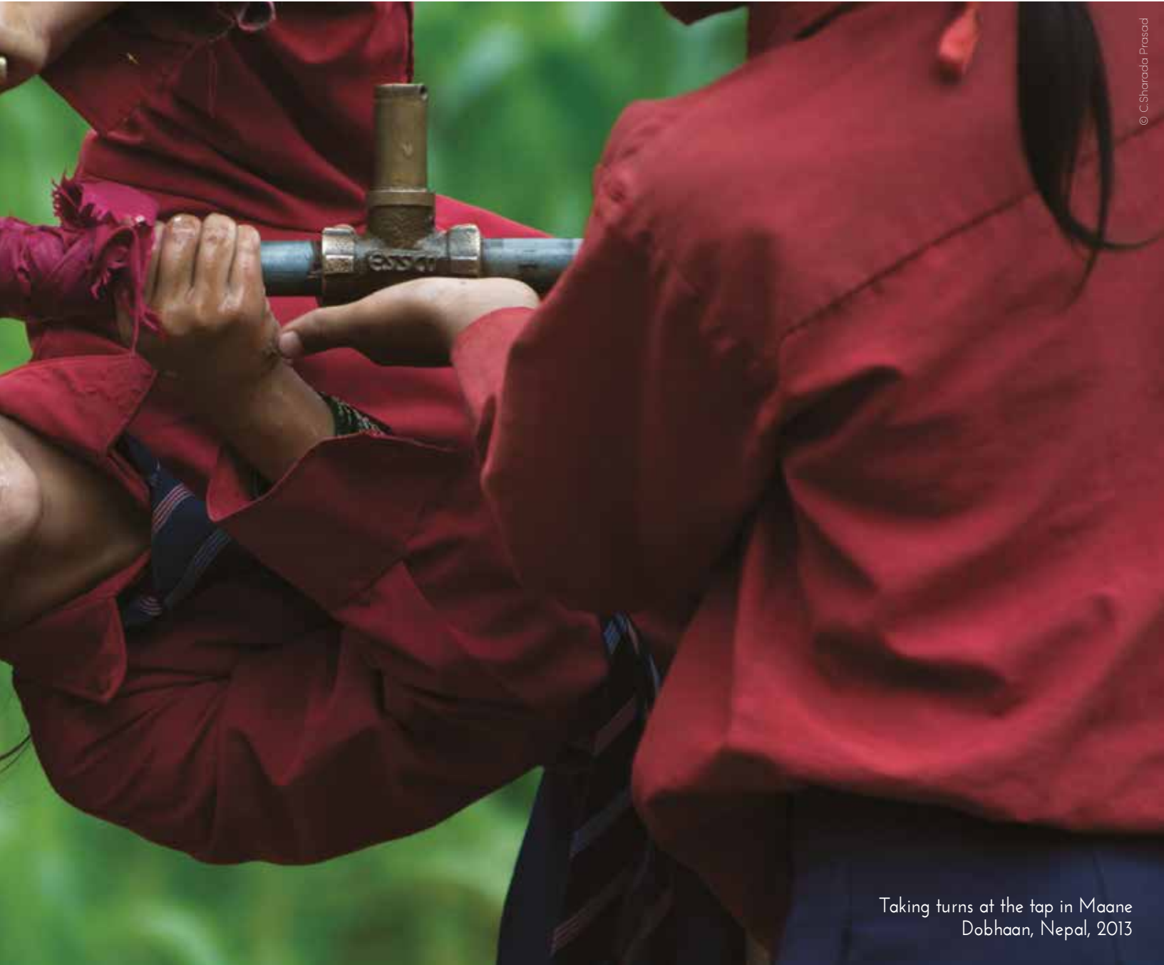
Taking turns at the tap in Maane Dobhaan, Nepal, 2013

energy for the poor without due attention to other dimensions of sustainable development.